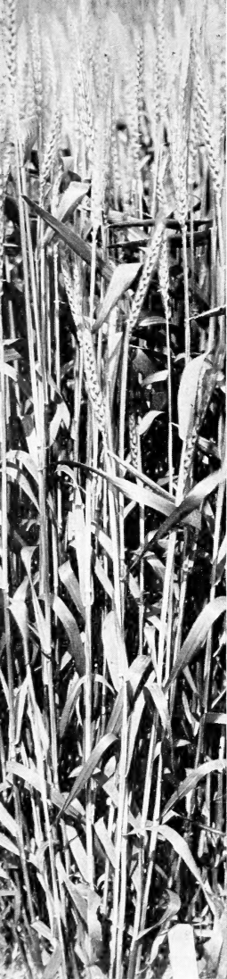
Leap's Prolific Wheat